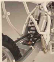
Monocross rear suspension