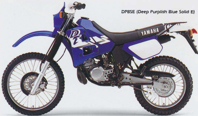
DPBSE (Deep Purplish Blue Solid E)