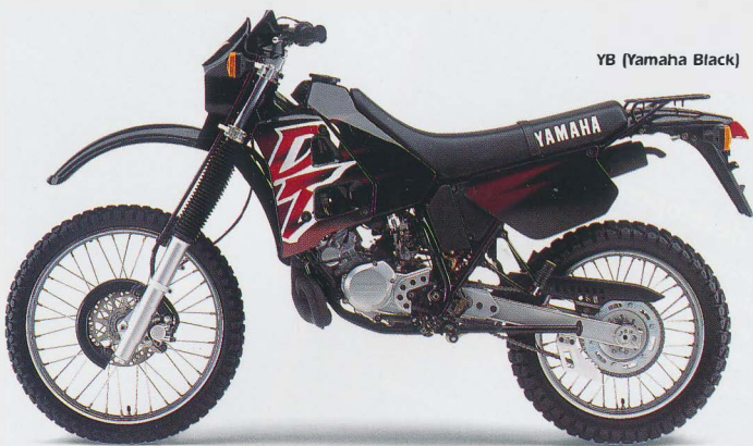
YB (Yamaha Black)