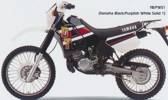
YB/PWS1 (Yamaha Black/Purplish White Solid 1)