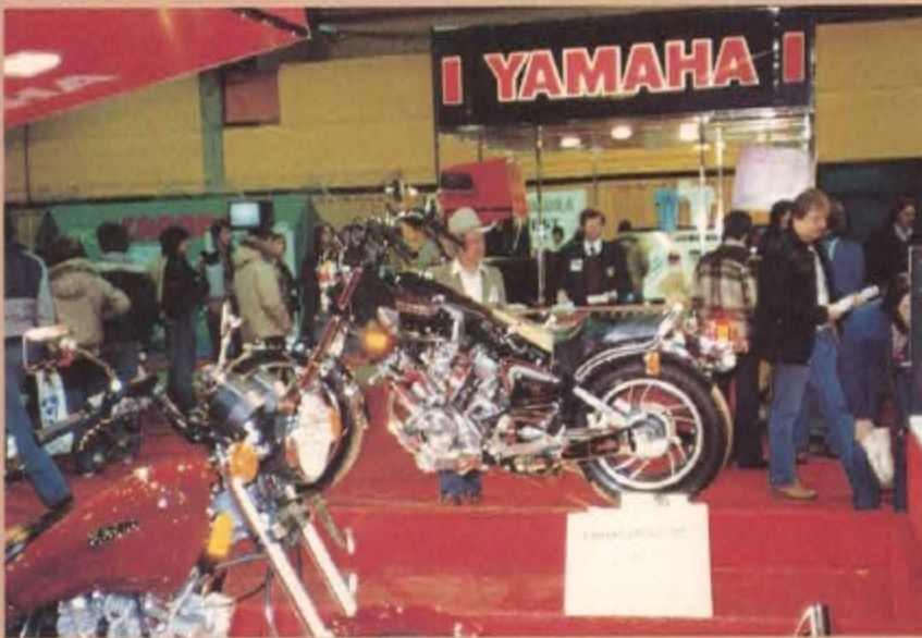
Virago 750's cutaway model

This kind of show is considered as a very effective promotion activity as commodities are shown directly to prospective customers, together with their significant product features. A number of similar shows take place in the United States, Europe and Australia. Some of these shows take a more advanced form called "Open House" which is promoted by Yamaha or individual importers as part of sales promotion program. The next issue of Yamaha News will introduce the details of Open House in Australia.