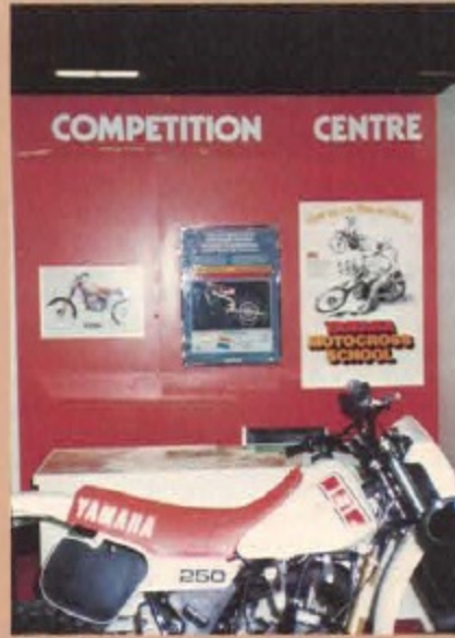
PR for Yamaha Motocross School at the show