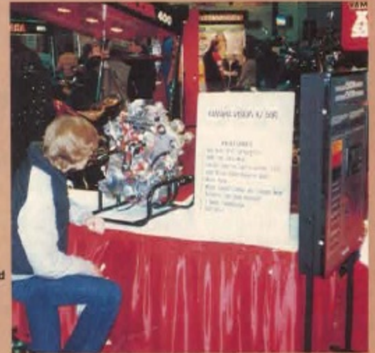
XV550's cutaway engine and simulation cycom display