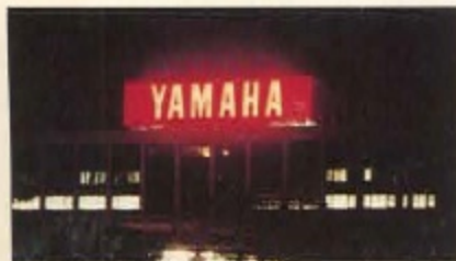
The new R & D Center is the largest-scale building in Iwata. "YAMAHA" neon sign.

The building features an advanced earthquake-proof and energy-saving design together with complete air conditioning facilities. A big 16-m span between pillars provides a vast space for flexible use to create a better working environment coupled with all kinds of ultra-modern R & D equipment and facilities.