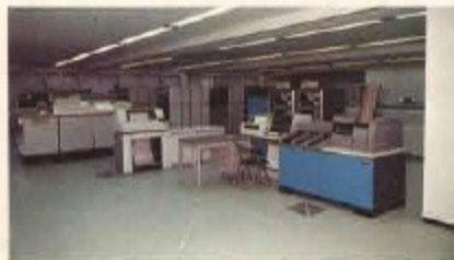
Most advanced layout and ultra-modern equipment and facilities