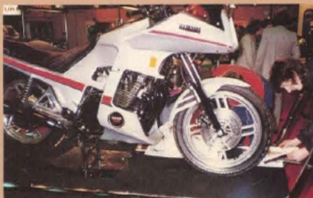
Seca Turbo, he is carefully reading "Yamaha news".