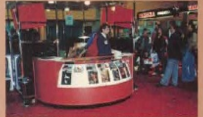
Yamaha display corner with the staff of Yamaha Motor Canada. Behind this corner a race film is being shown.