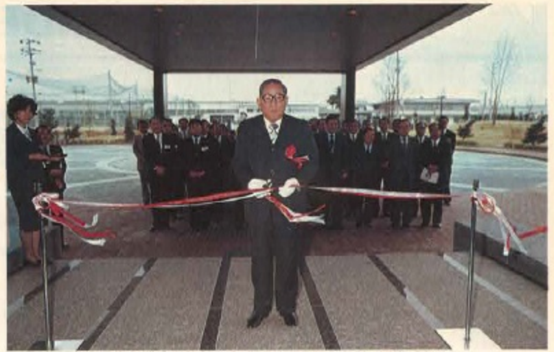
President Koike cutting a tape for the completion ceremony.