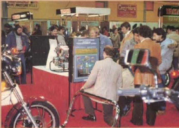
Simulation turbo display