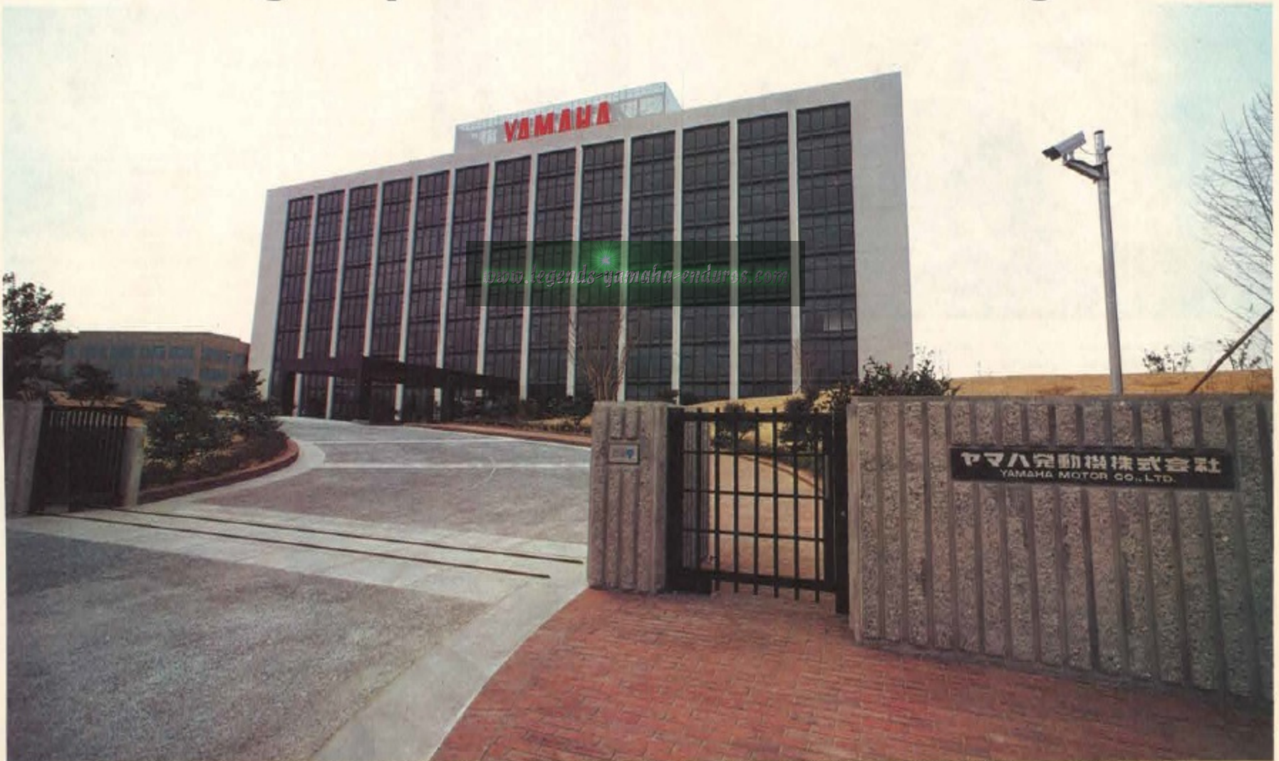
The new R & D Center is a steel-frame 8-storyed building with one underground floor. It is 35.11 meters high and total building area is 23,910.58m 2 . (taken from front entrance side)

The new Yamaha Research and Development Center which was under construction on the site continuous to that of the main office, was completed on February 4. The new center is an ultra-modern 8-storyed building with one underground floor and it will start its operation as the nucleus for the technical