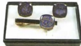
G125 "Lan Lan" Tie pin & Cuff links material: Brass