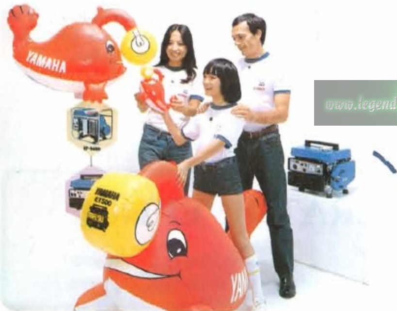
G122-2 "Lan Lan" Balloon (POP) material: Vinyl