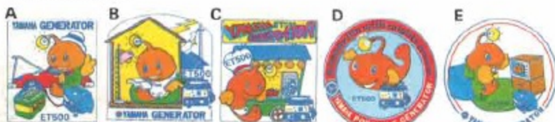
G109 "Lan Lan" Sticker A, B, C, D, E material: Vinyl