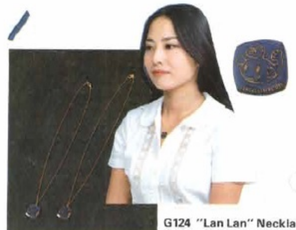
G124 "Lan Lan" Necklace size: Long (45 cm), short (40 cm) material: Brass