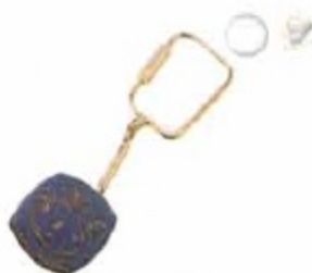
G128 "Lan Lan" Key holder material: Brass