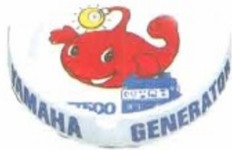
G117 "Lan Lan" Ashtray weight: 60g material: Melanin