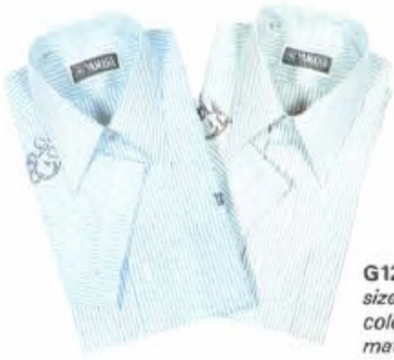
G123 "Lan Lan" Semisleeve shirt size: M, L, LL color: Blue stripe, gray stripe material: Polyester 65%, cotton 35%