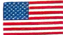
5" x 3" $1.00