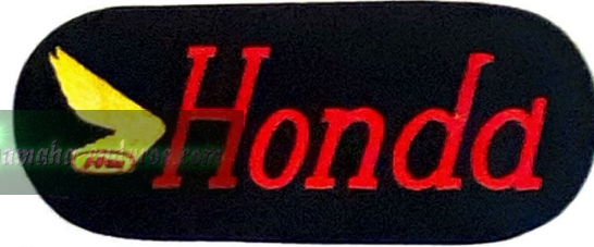
10 1/2" x 4" $1.50