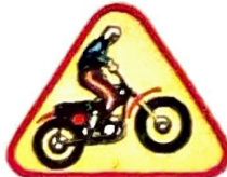
4" x 3" $1.00