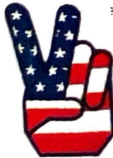
2 1/2" x 4" $1.00