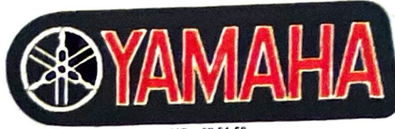
11" x 3" $1.50