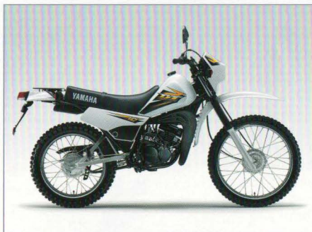
BLUISH WHITE COCKTAIL 1 (BWC1)