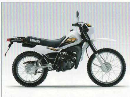
BLUISH WHITE COCKTAIL 1 (BWC1)