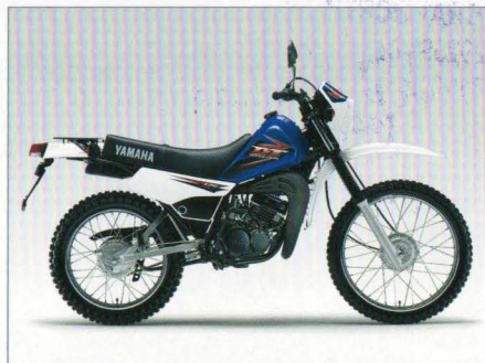
DEEP PURPLISH BLUE METALLIC C (DPBMC)