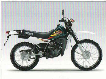
DARK CYAN METALLIC 8 (DCM8)