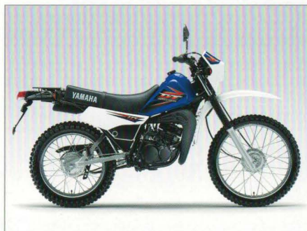
DEEP PURPLISH BLUE METALLIC C (DPBMC)