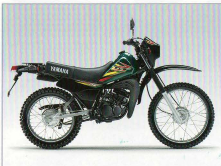
DARK CYAN METALLIC 8 (DCM8)