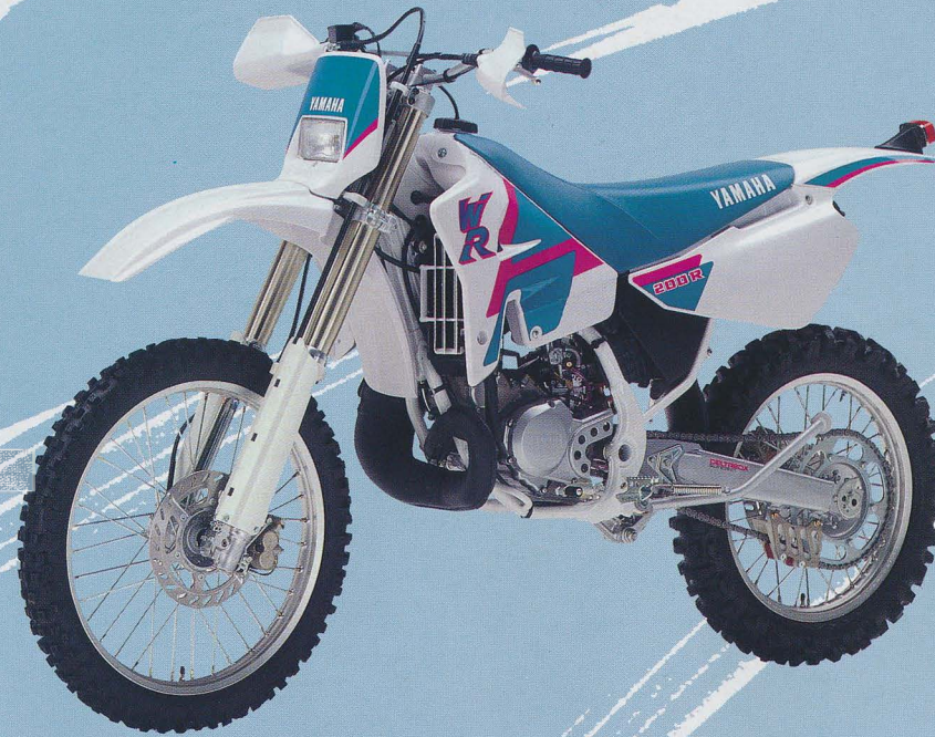
PWS1 (Purplish White Solid 1)

With its sophisticated specification, the latest high-performance WR200R is just what you need when you're feeling a little wild!