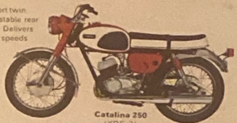
Catalina 250 (YDS-3)

5-speed sport twin 3-way adjustable rear suspension. Delivers 28 BHP for speeds from 85-90 mph