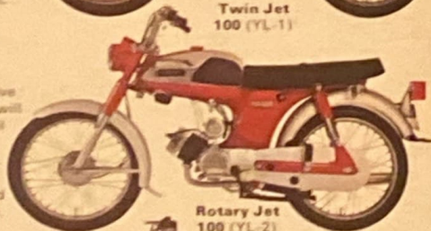
Rotary Jet 100 (YL-2)

A rotary valve single that will carry you all day long at 60-65 mph. 4-speed gearbox and oil injection.