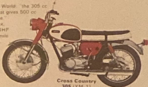
Cross Country 305 (YM-1)

Says Cycle World: "the 305 cc machine that gives 500 cc performance." 5-speed box, twin 29.5 BHP engine, 1/4-mile in 14.9 sec.