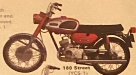
180 Street (YCS-1)

Complete with electric starter and freeway approved, the twin YCS-1 generates 21 BHP. 60-90 mph.