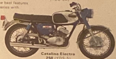
Catalina Electro 250 (YDS-5)

Combines the best features of the YDS series with convenient electric starter. Puts out 29.5 BHP and a speed range of 90-100 mph.