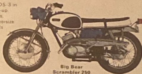
Big Bear Scrambler 250 (YDS-3C)

The potent YDS-3 in scrambler get-up. Twin-cylinders, twin-carbs, oversize brakes. Speeds up to 90 mph.