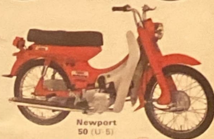
Newport 50 (U-5)

Easiest to buy, easiest to operate. 200 mpg; speeds of 40-45 mph. Rotary Valve single with automatic clutch and 3-speed box.