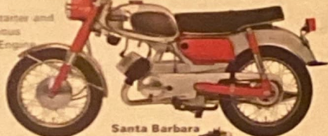
Santa Barbara 125 (YA-6)

Has electric starter and Yamaha's famous Rotary Valve Engine. Greatest for economy. 13.5 BHP for speeds to 70 mph.