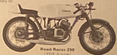
Road Racer 250 (YDS-5 type)

Probably the winningest road racer in the history of motocycling. 36 BHP. 5-port twin-cylinder engine. Exceeds 130 mph.