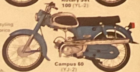
Campus 60 (YJ-2)

Senior bike styling at freshman price. The YJ-2's rugged rotary valve single-cylinder engine will do 50-55 mph.