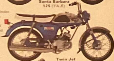
Twin Jet 100 (YL-1)

This twin-cylinder, twin-carb job is in a class by itself. Dual pipes, 4-speed gearbox, oil injection. 9.5 BHP. 60-65 mph.