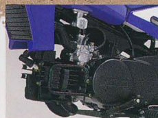
Engine Easy-to-maintain 79 cc 2-stroke air-cooled engine delivers a smooth band of controllable power for spirited performance. And thanks to its clutchless 3-speed semi-automatic transmission this proven play bike is a favourite with the whole family!