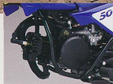
Engine Fully automatic 50 cc 2-stroke engine produces a smooth flow of responsive power. And with its easy-to-adjust throttle limiter and muffler restrictor, parents can alter performance to suit their child's ability.