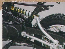
Rear suspension/Brake PW80's race-developed Monocross rear suspension system makes this lightweight fun bike so comfortable to ride and easy to handle - while a foot operated drum rear brake is there when you need it.