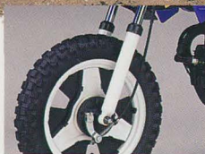
Front suspension For added rider confidence over bumpy ground the latest PW50 kid's bike is equipped with oil-damped telescopic front forks that ensure smooth handling, extra comfort and easy steering.