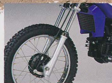
Front suspension/Brake With its long travel telescopic front forks the rugged PW80 is built to deliver smooth handling and lightweight steering over rough terrain. And for reliable stopping power there's a proven drum front brake.