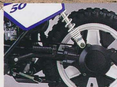
Shaft drive Just one of the many rider-friendly features on the PW50 is its fully enclosed shaft drive. Clean running, ultra reliable and requiring very little routine maintenance, this system is ideal for young kids.