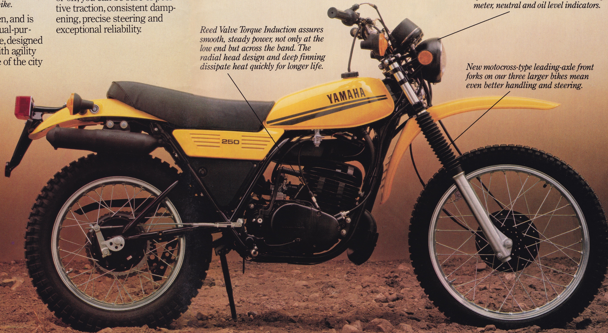
New motocross-type leading-axle front forks on our three larger bikes mean even better handling and steering.