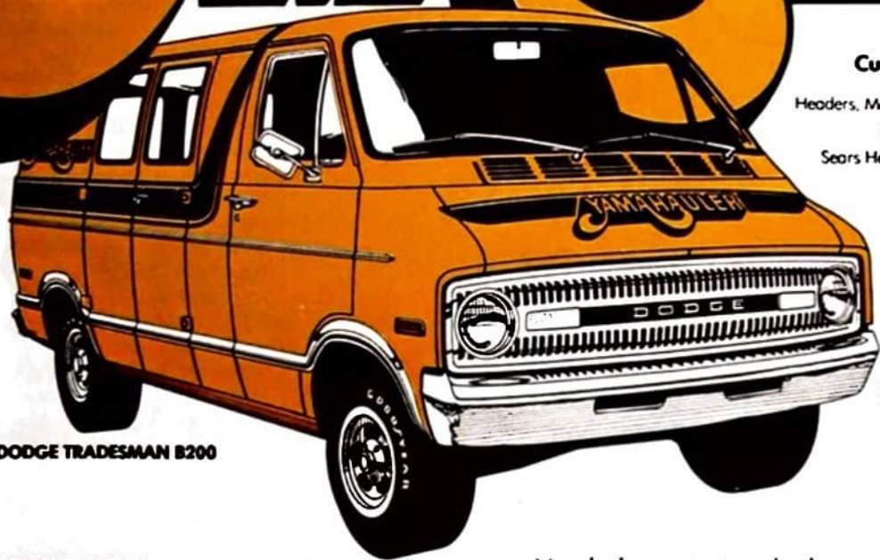
DODGE TRADESMAN B200